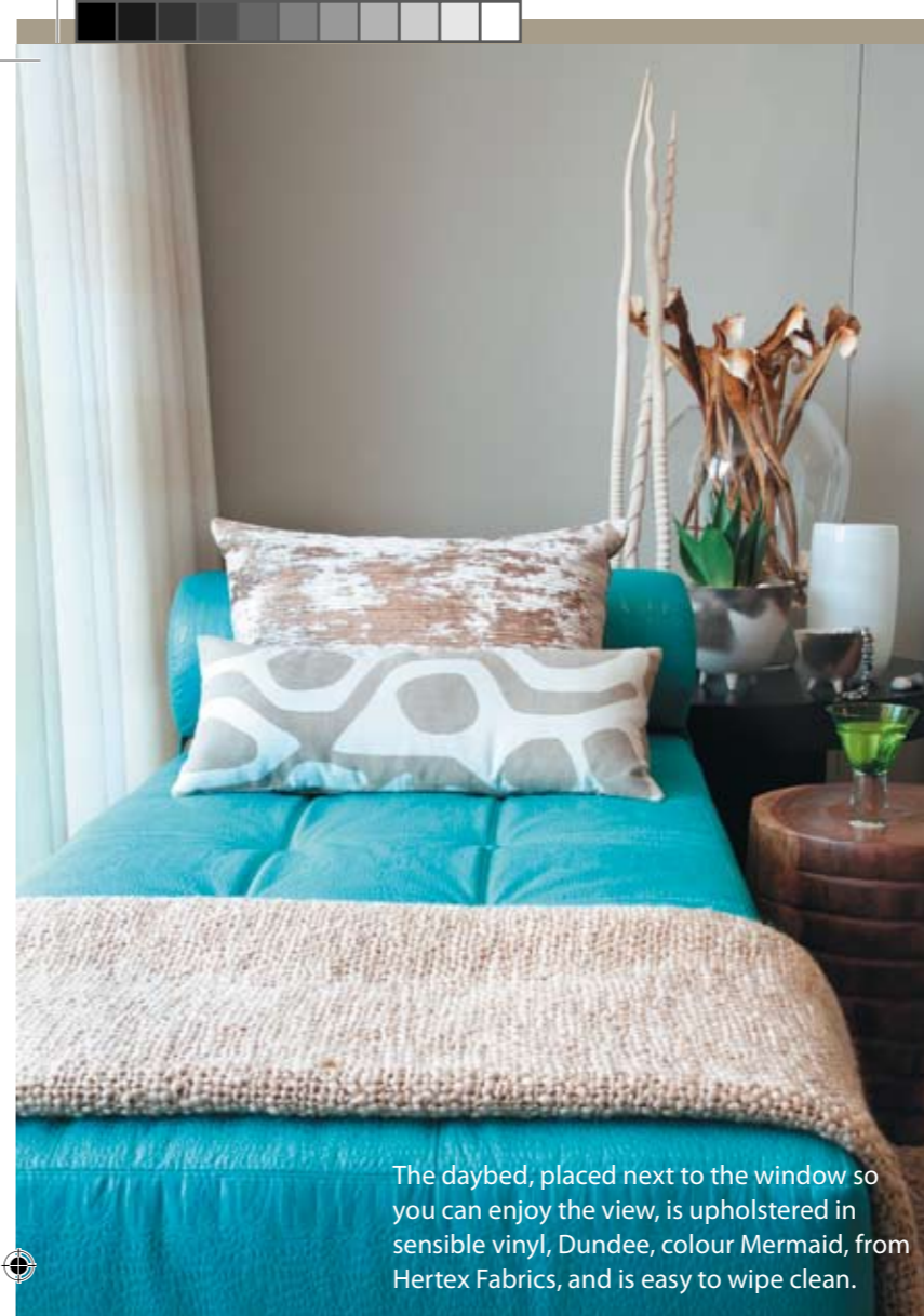
The daybed, placed next to the window so you can enjoy the view, is upholstered in sensible vinyl, Dundee, colour Mermaid, from Hertex Fabrics, and is easy to wipe clean.

As the family are avid readers, floating books have been included in the lounge so that their favourites are close at hand, but are positioned high enough to keep treasured ornaments safely out of reach of inquisitive fingers. "I used a lot of rounded furniture to avoid knocking themselves on sharp edges. They love shaped coffee tables and it's their favourite play reading area," says Odette.